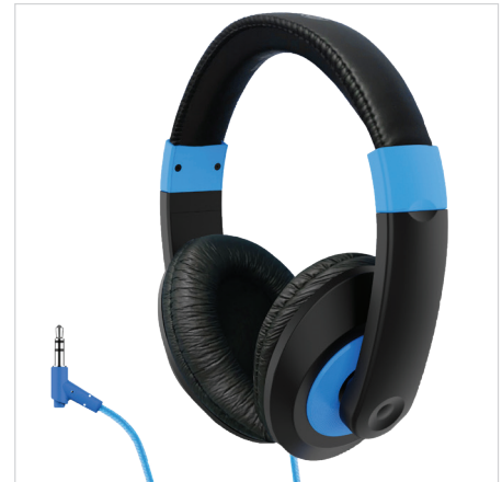
Smart-Trek™ with Blue Accents (ST1BL)

Product: 0.37 lbs., 7" x 5.25" x 3" Shipping: 0.65 lbs., 8.2" x 6.4" x 4.5" Warranty: 1 Year