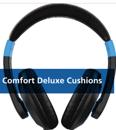
Comfort Deluxe Cushions